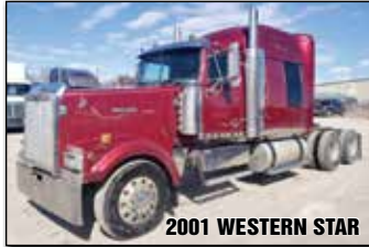
2001 WESTERN STAR