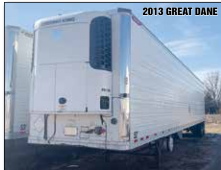
2013 GREAT DANE

2013 UTILITY 3000R Aluminum Reefer, 53 Ft. Long, 102 Inches Wide, 13 Ft. 6 Inches High, Carrier 2500A Unit, Heavy Duty Floor, Scuff Plate, Stainless Steel Front Radius Panels, Stainless Steel Rear, Rear Vent, Side Skirts, Cold Chute, Stainless Steel Quilted Swing Doors, Air Ride Suspension, Sliding Tandem, 22.5 Low Profile Tires, Disc Wheels