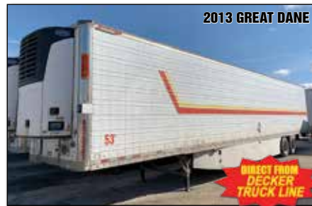
2013 GREAT DANE

4 2014 UTILITY 3000R Aluminum Reefer, 53 Ft. Long, 102 Inches Wide, 13 Ft. 6 Inches High, Carrier Vector 8500 Unit, Heavy Duty Floor, Scuff Plate, Stainless Steel Front Radius Panels, Stainless Steel Door Frame, Side Skirts, Cold Chute, Stainless Steel Quilted Swing Doors, Air Ride Suspension, Sliding Tandem, 22.5 Low Profile Tires, Aluminum Disc Wheels