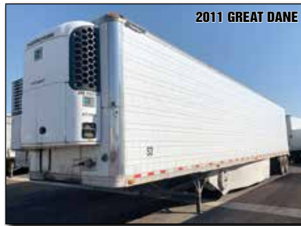
2011 GREAT DANE

2007 GREAT DANE Super Seal Aluminum Reefer, 53 Ft. Long, 102 Inches Wide, 13 Ft. 6 Inches High, Thermo King SB-210 Unit, Heavy Duty Floor, Scuff Plate, Stainless Steel Front Radius Panels, Stainless Steel Door Frame, Cold Chute, Stainless Steel Swing Doors, Air Ride Suspension, Sliding Tandem, 22.5 Low Profile Tires, Disc Wheels