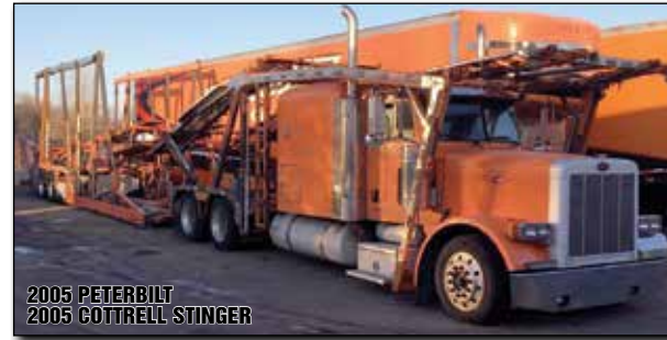
2005 PETERBILT 2005 COTTRELL STINGER

AM/FM Radio, Compact Disc Player, Tilt And Telescoping Steering Wheel, Cruise Control, Power Windows, 250 Inch Wheel Base, 22.5 Low Profile Tires, Aluminum Disc Wheels, 2005 Cottrell Stinger Automobile Transport Trailer