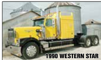
1990 WESTERN STAR

1990 WESTERN STAR 4900SF Conventional, 68 Inch High Roof Stratosphere Sleeper, Caterpillar 3406B Engine, 425 H.P., Engine Brake, 15 Speed Transmission, 40,000 Lb. Rear Ends, Air Ride Suspension, Hydraulic Power Steering, Air Conditioned, Dual Aluminum Fuel Tanks, Dual Chrome Stacks, Dual Stainless Steel Air Cleaners, Stainless Steel Exterior Visor, Full Fenders, Mesa Interior, AM/FM Radio, Compact Disc Player, Tilt And Telescoping Steering Wheel, Cruise Control, Power Right Hand Window, Air Slide 5th, 265 Inch Wheel Base, 22.5 Low Profile Tires, Aluminum Disc Wheels