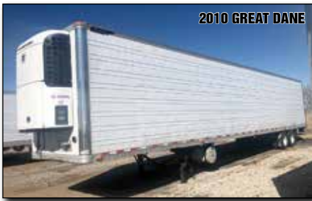
2010 GREAT DANE

2010 GREAT DANE Super Seal Aluminum Reefer, 53 Ft. Long, 102 Inches Wide, 13 Ft. 6 Inches High, Thermo King SB-200TG Unit, Heavy Duty Floor, Scuff Plate, Stainless Steel Front Radius Panels, Stainless Steel Rear, Stainless Steel Door Frame, Rear Vent, Cold Chute, Stainless Steel Quilted Swing Doors, Air Ride Suspension, Sliding Tandem, 22.5 Low Profile Tires, Disc Wheels, Aluminum Discs Outside