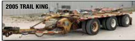
2005 TRAIL KING