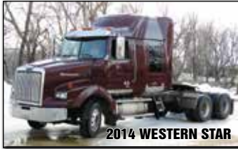
2014 WESTERN STAR

2014 WESTERN STAR 4900SB Conventional, Glider Kit , 54 Inch High Roof Stratosphere Sleeper, Detroit Series 60 12.7 Liter Engine, 450 H.P., Engine Brake, 13 Speed Transmission, 40,000 Lb. Rear Ends, 3.58 Ratio, Air Ride Suspension, Hydraulic Power Steering, Chrome Bumper, Dual Aluminum Fuel Tanks, Single Chrome Stack, Stainless Steel Exterior Visor, Cab Extenders, Stainless Steel Quarter Fenders, Bunk Heater, Mesa Interior, AM/FM Radio, Tilt And Telescoping Steering Wheel, Cruise Control, Power Windows, Air Slide 5th, 237 Inch Wheel Base, 22.5 Low Profile Tires, Aluminum Disc Wheels