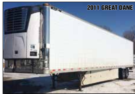
2011 GREAT DANE

2 2013 GREAT DANE Aluminum Reefer, 53 Ft. Long, 102 Inches Wide, 13 Ft. 6 Inches High, Carrier 2500A Unit, Heavy Duty Floor, Scuff Plate, Stainless Steel Front Radius Panels, Stainless Steel Rear, Side Skirts, Cold Chute, Stainless Steel Swing Doors, Air Ride Suspension, Sliding Tandem, Tire Inflation System, 22.5 Low Profile Tires, Aluminum Disc Wheels