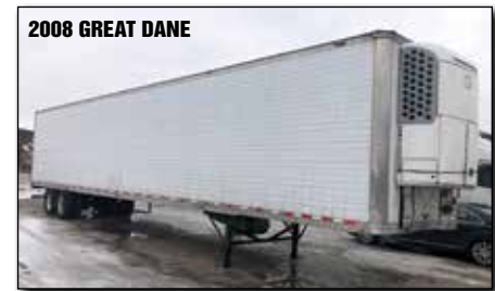
2008 GREAT DANE

1993 DORSEY Aluminum Reefer, 48 Ft. Long, 102 Inches Wide, 13 Ft. 6 Inches High, Carrier Phoenix Ultra XL Unit, Heavy Duty Floor, Scuff Plate, Stainless Steel Rear, Stainless Steel Quilted Swing Doors, Spring Suspension, Sliding Tandem, 22.5 Low Profile Tires, Disc Wheels