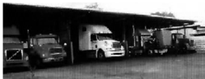
South Star's Wash Bays are EPA Certified