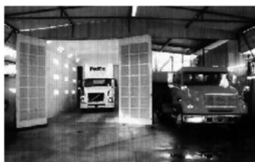
Paint and Body Shop