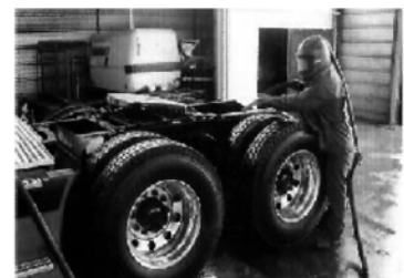
Sand Blasting Shop